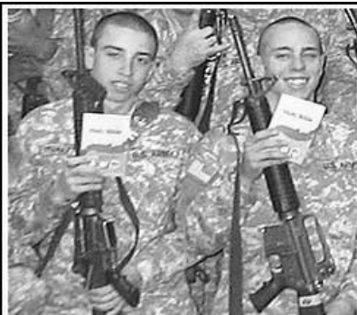
Soldiers at Fort Jackson with their guns and Bibles.

Throughout history, real social change has happened when ordinary people get pissed off with business as usual, talk to each other, get organized, and take to the streets. We have surely reached the point when we the ordinary people are truly pissed off. We have seen the wealthiest section of society get a wee bit worried and been handed billions of tax payers money. While we have been told that cuts in social spending are unavoidable. We face massive unemployment at the time of these cuts and we get that shit, "We are all in this together". If we expect the corrupt politicians and the corporate world to sort our problems then we deserve all we get. So, we're pissed off, can we talk? Can we get organised? Can we take to the streets and bring about real social change?