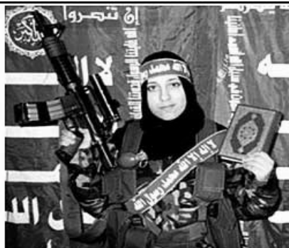
Hamas suicide bomber with guns and Koran.